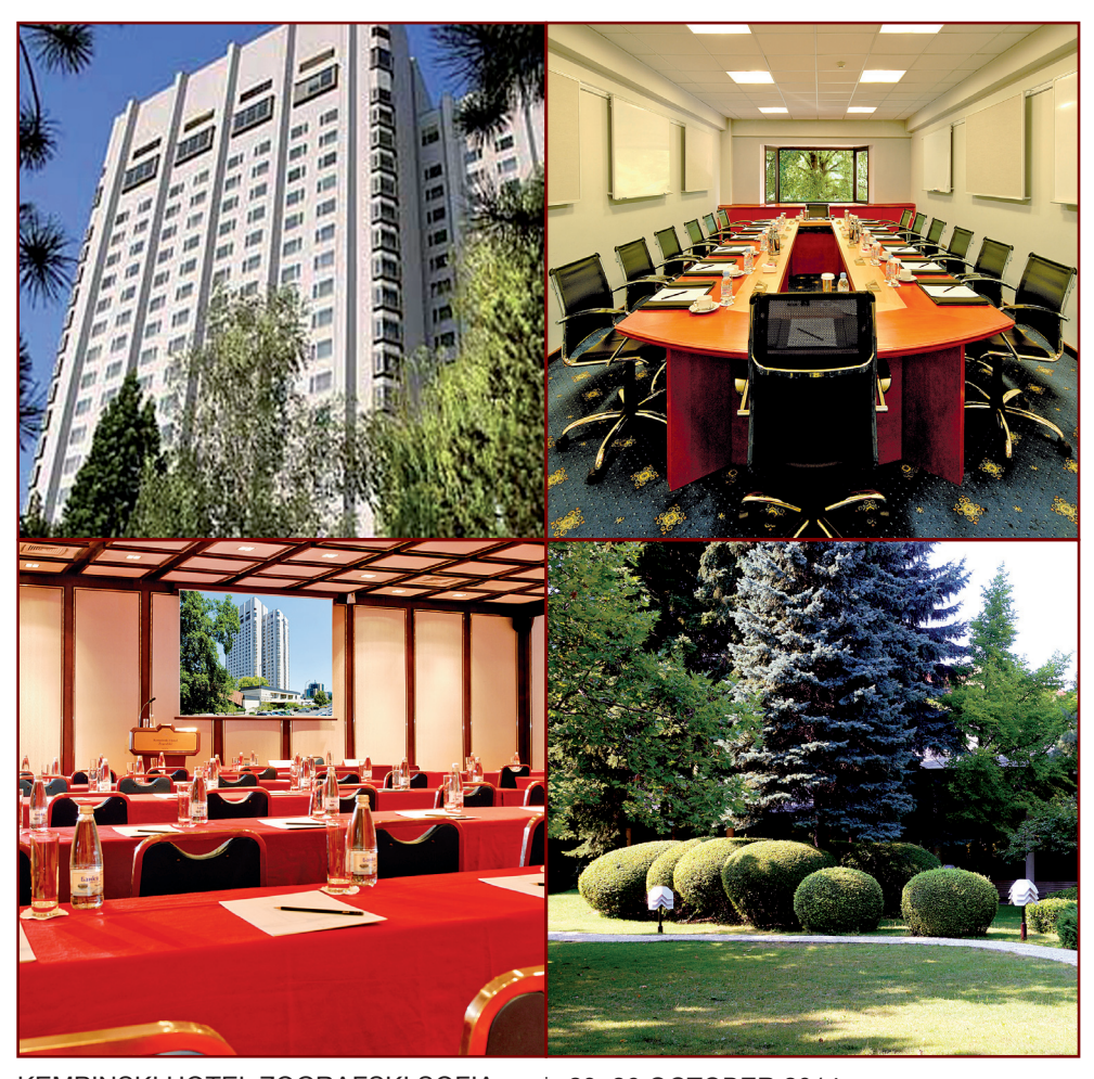
KEMPINSKI HOTEL ZOGRAFSKI SOFIA